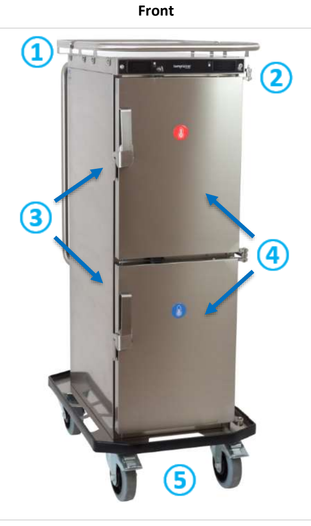
Figure 1. Temptainer Premium Tower model with active heating ( m{H} ) and active cooling ( m{CC} ).

The Twin trolley has double compartments next to each other. The compartment can be combined in any way for cold (CC, C) , hot (H) or neutral (N) storage.